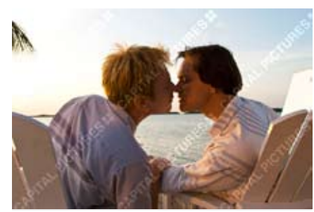
SWINGERS: JIM CARREY AND EWAN MACGREGOR RECREATE 80'S HIGHLIFE IN I LOVE YOU PHILLIP MORRIS. THE FILM VERSION OF RUSSELL'S LIFE