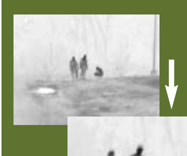
4·1 CONTINUOUS ELECTRONIC ZOOM