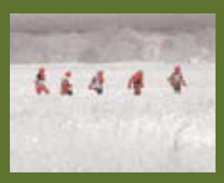
INSTALERTTM COLOR TAGGING

Extensive documentation supports field integration and service.