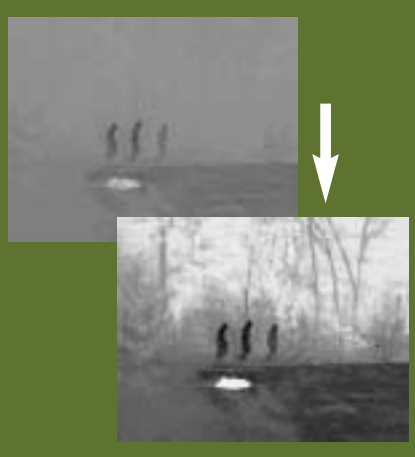
AUTO CONTRAST ENHANCEMENT