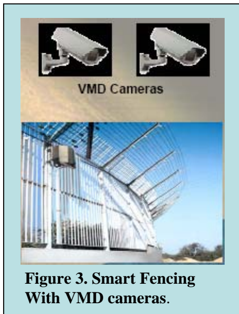
Figure 3. Smart Fencing With VMD cameras.

alerting with automatic camera slaving and incident recording. Three possible scenarios can be addressed. The first simply uses a vibration detection fence system and relies on that detection to signal control and monitoring stations that an event has occurred. The second, shown in Figure 3, introduces video motion detection (VMD) cameras in the smart fence to provide an advanced warning of an impending intrusion. Scenario 3 integrates both VMD and radio frequency (RF) sensing to provide an all-weather warning system.