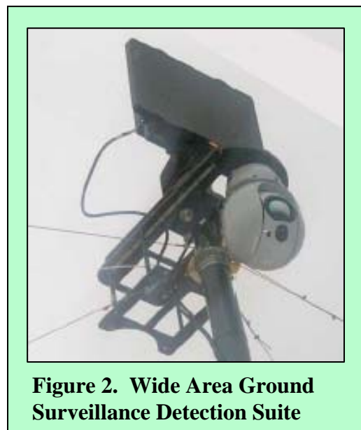
Figure 2. Wide Area Ground Surveillance Detection Suite

Smart fences provide warning, detection, and