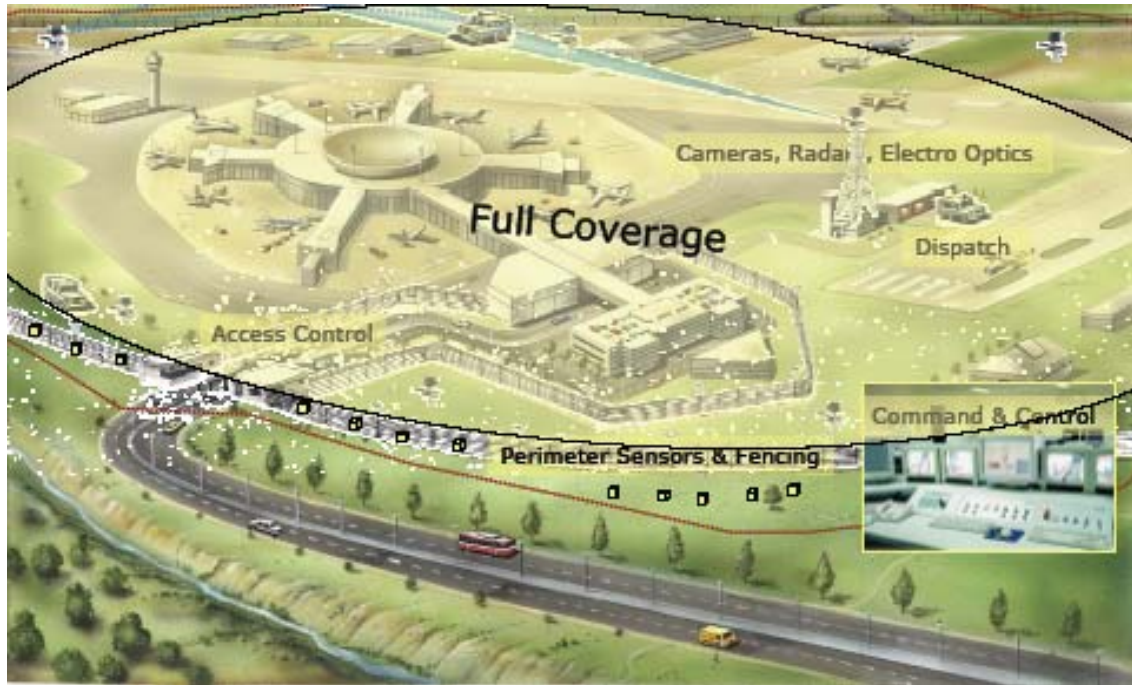
Figure 1. Concept Overview. Airport perimeter full coverage security is provided by a combination of integrated sensor technologies fused through a command and control suite, and augmented by secure, wireless, wide area communications.

showing what the radar detects. Object detection sizes are dependent on the capabilities of each intelligent detection system but would be set so that each system compliments the other. Detection rules and system capabilities would be designed to resolve object sizes to whatever range is necessary to adequately survey the airport perimeter.