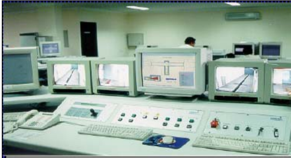
Figure 5. Example of a Mobile Crisis Command, Control, and Communications (C3) Center Integrated with Airport C3 facilities and capabilities

Existing command, control and communications (C3) at the airport are augmented to accept the perimeter sensor inputs to provide multi-sensor integration, analysis and semi-automated camera control, and communicate with either first responders that investigate and contain the intrusion or provide activation of other tactics that serve to ward off animals viewed as intruders (see Figure 5). The command structure is derived from data and intelligence developed by the various integrated sensor suites. This provides a means of management control of suspected interdictions. Using available data, control is synthesized and exercised by operators to provide operational direction to first responders or to invoke other tactics.