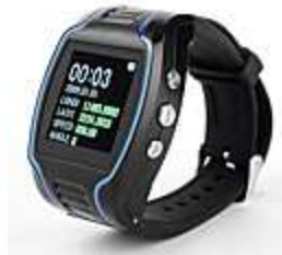
Quadband Wrist Watch Cell phon...