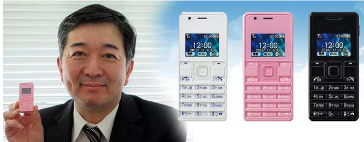
Number 1: Willcom WX06A

Just launched in Japan, the WX06A is officially the world's smallest phone at just 32 x 70 x 10.7mm and weighing in at 32 grams . Due to the teeny tiny size of the phone it doesn't have a camera and talk time battery is just 2 hours. But you are still able to text, make calls and send emails – it even has a fold out antenna so you can get better signal. This little phone, which comes in black, white and pink, is only available in Japan at the moment and the price hasn't yet been revealed. The question is, will anyone be able to use the keys?!