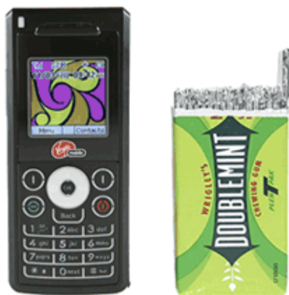
Number 6: UTStarcom Slice

It has long been said that the next logical step for mobile telephones is to move across to wearable technology and the M500 Watch Phone is a perfect example of that possible transition. For those that love the idea of small cell phones the M500 is a fully-functional and wearable device that has the two-fold benefits of working as a wristwatch and a mobile telephone . It may not feature the standard form-factor of what we know and accept as a cell phone, but it certainly offers a unique approach to mobile technology.