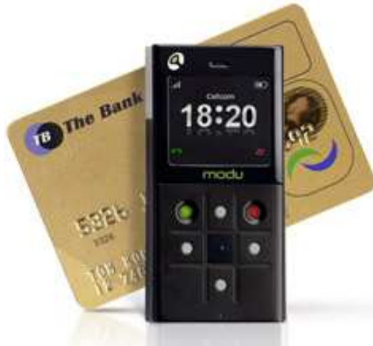
Number 2: The Modu Mobile

Only recently beaten by the Willcom , The Modu Mobile was named by the Guinness Book of World Records as the World's Lightest Phone until 2013, the handset weighs just over forty grams and measures a mere 72 x 37 x 7.8 mm . However, the Modu Mobile's diminutive size doesn't prevent it from performing most of the functions you need in a phone. It's able to make calls, send SMS messages, play MP3s and take photos. For some of these functions you may need to use attachments, bulking up the size a little, but this phone is still a wonder of micro design.