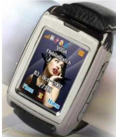
Number 5: CellWatch M500 Watch Phone

It has long been said that the next logical step for mobile telephones is to move across to wearable technology and the M500 Watch Phone is a perfect example of that possible transition. For those that love the idea of small cell phones the M500 is a fully-functional and wearable device that has the two-fold benefits of working as a wristwatch and a mobile telephone . It may not feature the standard form-factor of what we know and accept as a cell phone, but it certainly offers a unique approach to mobile technology.