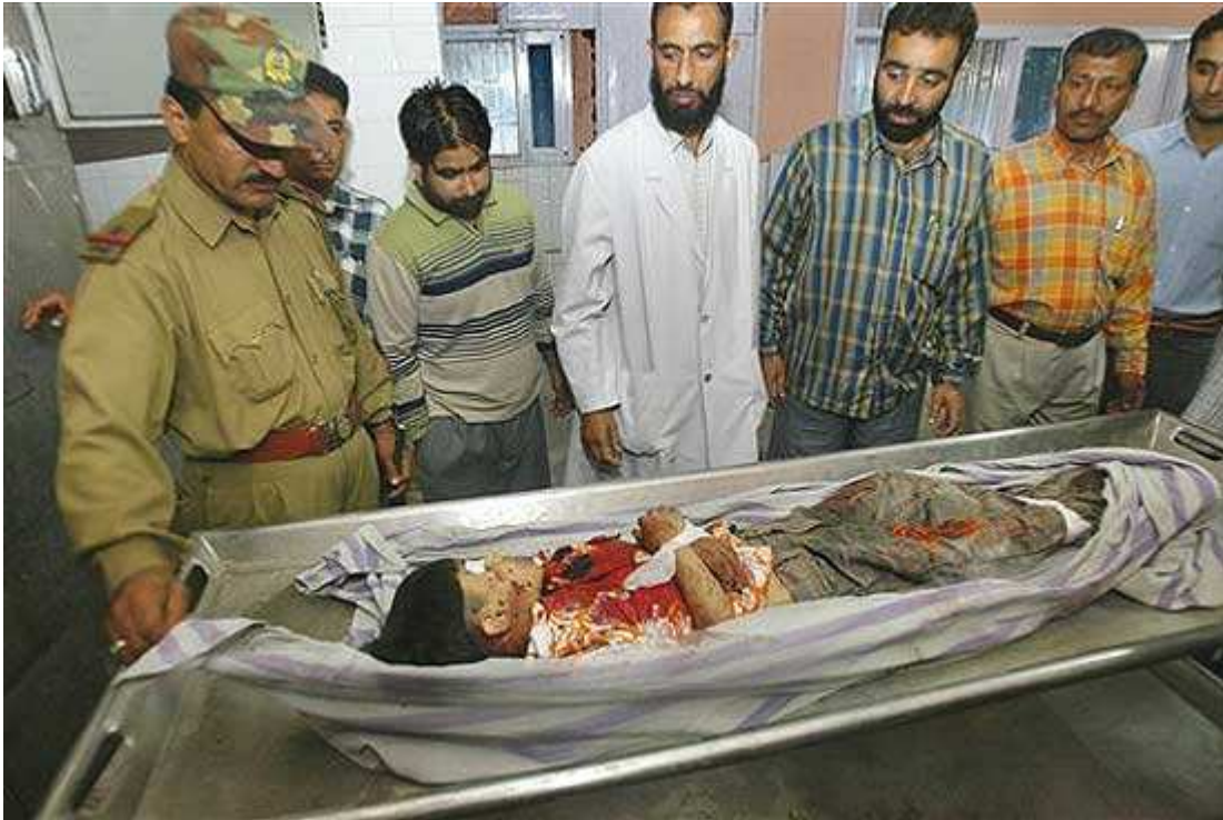
(2) The UN Charter on 'Terrorism'

'Action with respect to threats to the peace, breaches of the peace, and acts of aggression'