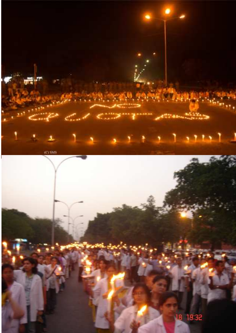
Doctors protest reservation

In 1981, the UNO in its General Assembly declared that any citizen of a member country of the UN has the right to follow any religion or faith of his or her choice. It would be acceptable to the law of that country.