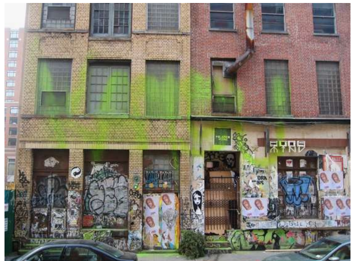
Image Notes 1. needed more contrast